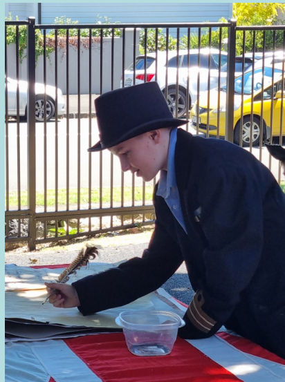
Room 21 Sign their class treaty by re-enacting the signing of Te Tiriti o Waitangi