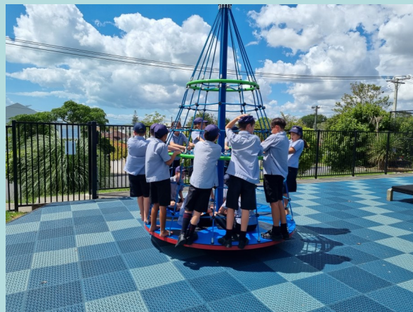
Fun at lunch time

Enjoy the weekend and please look after yourself and your family. We are sure to reach the peak soon and look forward to seeing numbers of new cases fall.