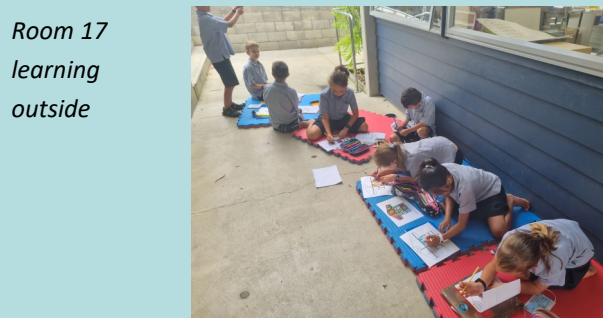
Room 17 learning outside