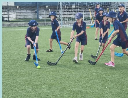
Children enjoying PE